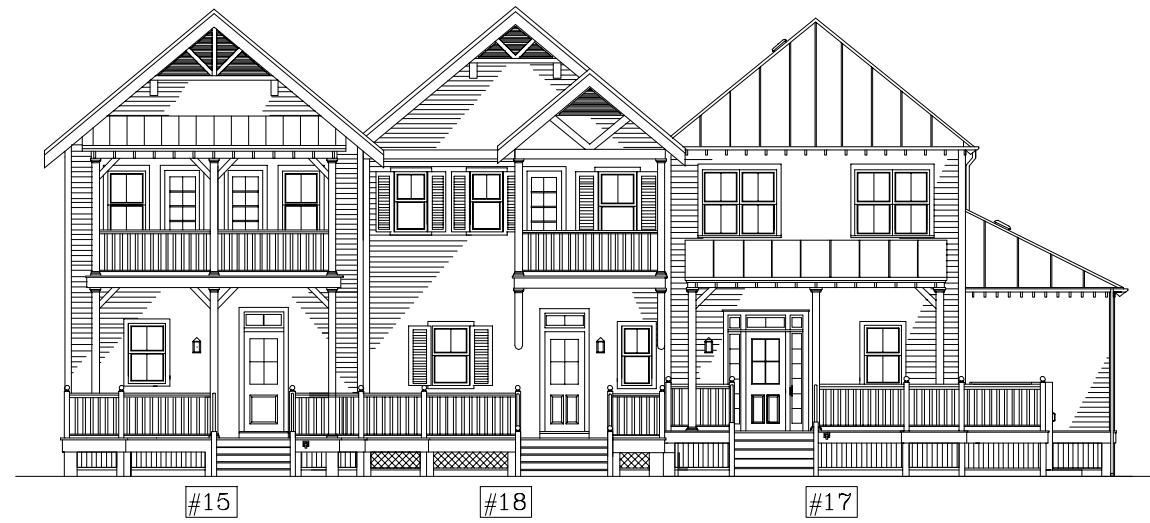
UNITS 15-17 FRONT ELEVATIONS