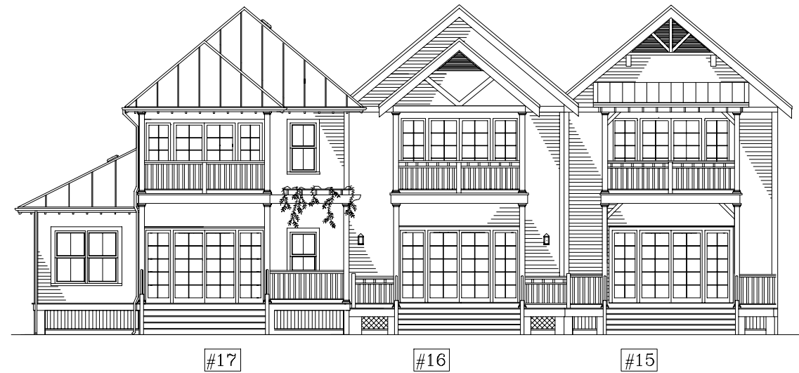
UNITS 15-17 REAR ELEVATIONS