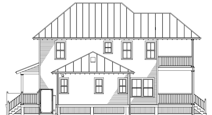
UNIT 17 SIDE ELEVATION