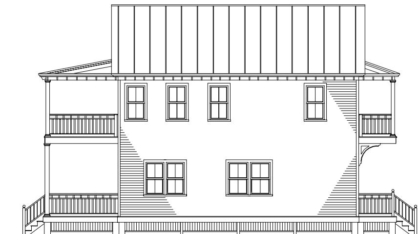
UNIT 15 SIDE ELEVATION